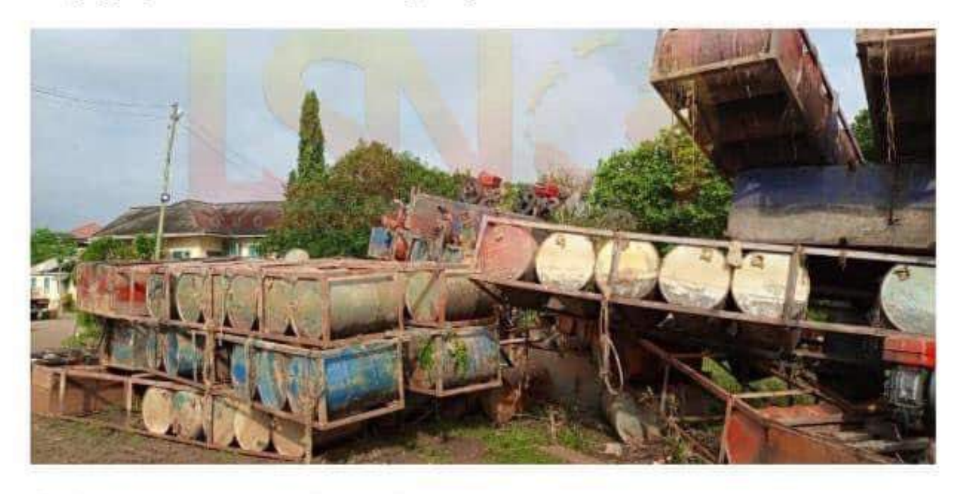
Dredging equipment at a depot far away from mining site