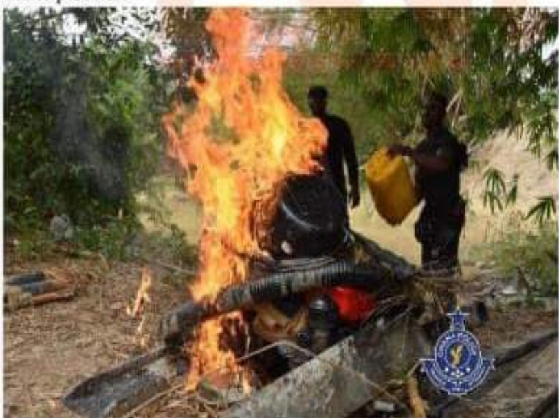
Policemen from Operation Vanguard burning 'Chang Fang' motors