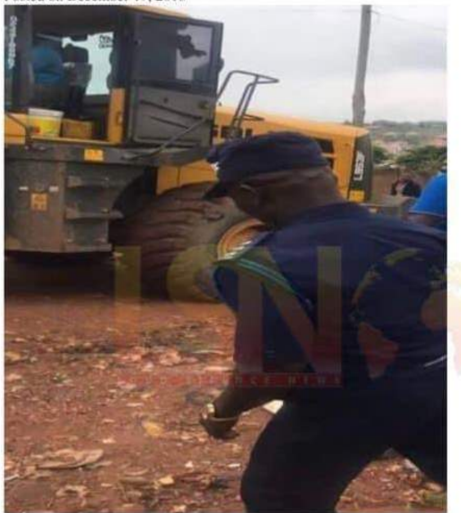
...Destroys Large Scale Mining Company Equipment Worth Millions Of Dollars, Government To Be Dragged To Court

By admin New Crusading Guide Posted on December 19, 2018