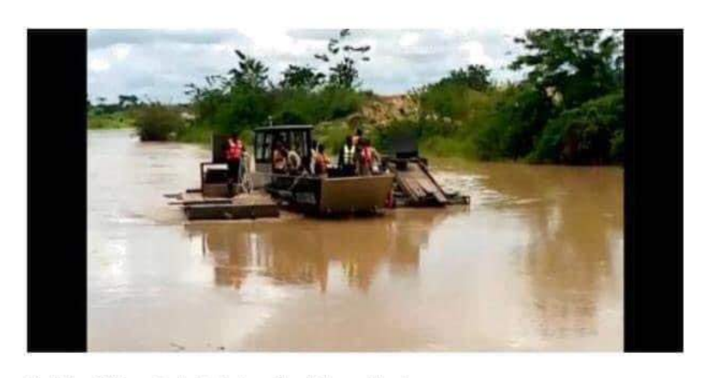
Dredging platform attached to the two sides of the speed boat