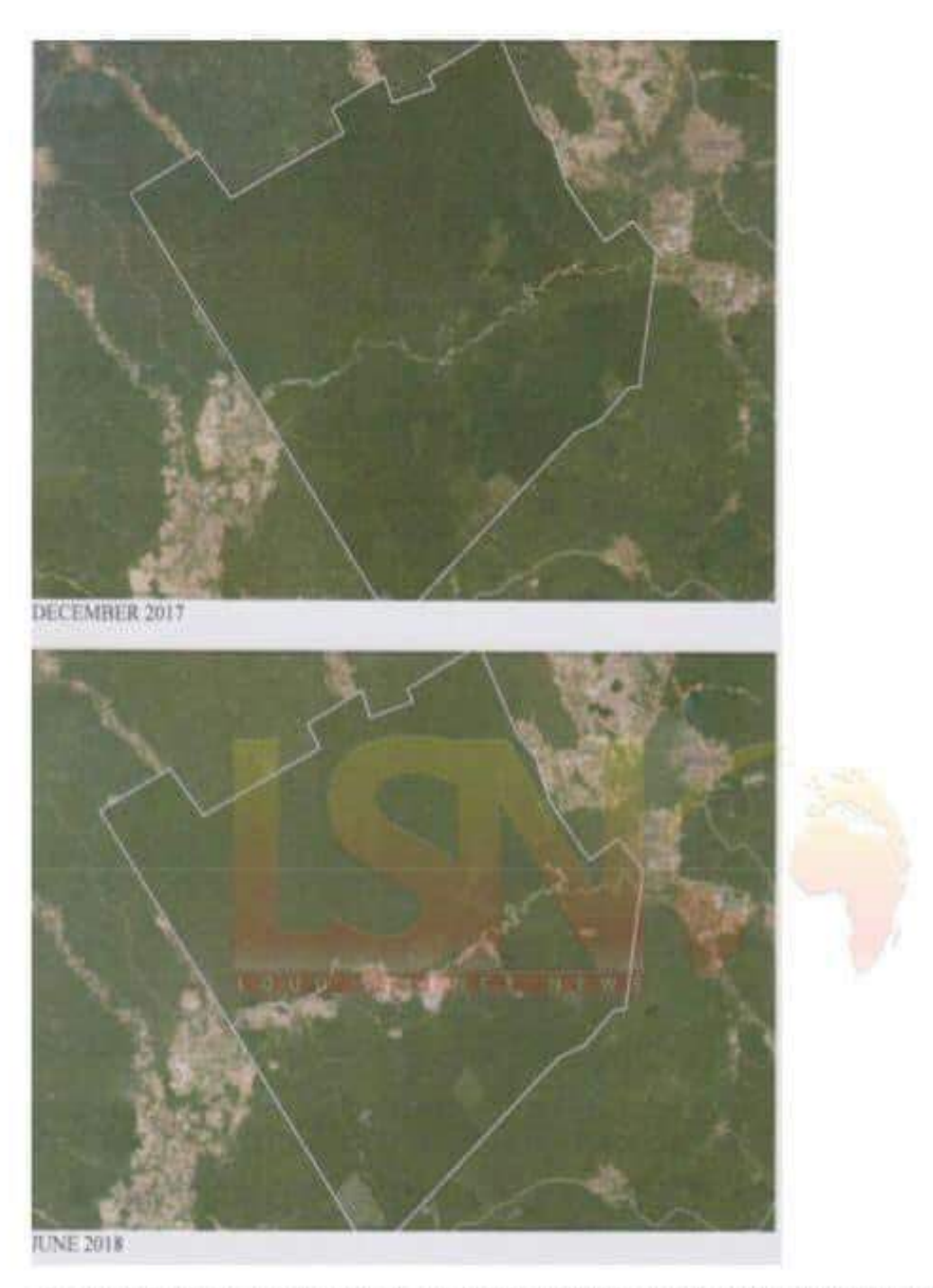
Apaprama forest reserve is outlined and the River Offin is seen running through it. The Damage started soon after NPP came to power and the progression of the damage to the forest and river can be seen in all the images.